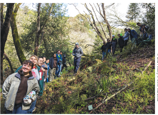
Cal Habitat Club members after a rainy day of climbing the muddy, steep slopes in Fern Glade

We hope you are all enjoying the trails and all the plants in bloom. Garber Park is full of small surprises everywhere you look, so please keep an eye out for our cute newts and banana slugs. You never know when one might be crossing your path!