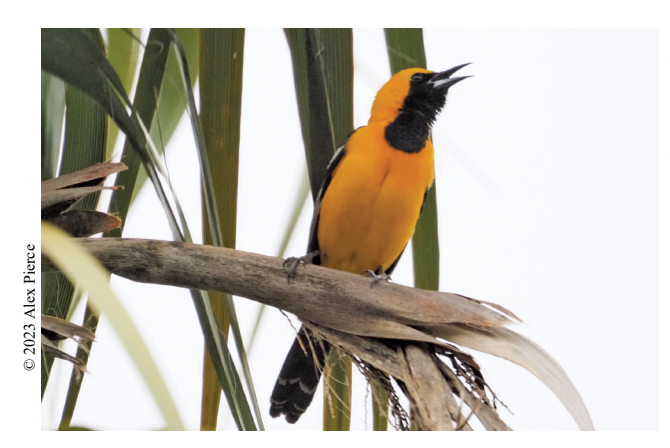
A male Hooded Oriole (Icterus cucullatus) singing atop a palm frond last spring on Gravatt Drive.