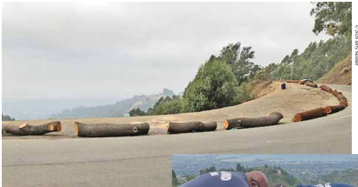
A line of logs deter night time visits to the popular lookout near Marlborough Terrace. Log placement is a work in progress as an inter agency working group tries to decide on the best course of action.

by local residents. Oakland has primary jurisdiction of most of Grizzly Peak Boulevard (15 feet from the center line) no matter whose property is on either side of the road. Subsequently, Oakland beefed up patrols to educate people in the lookouts about the information on newly installed signs, "No Smoking; Closed from 9 PM-6 AM."