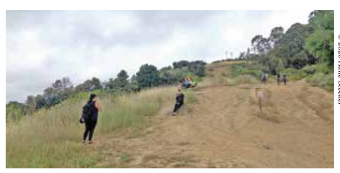
Social distancing on the Stonewall-Panoramic Ridge Trail.

Please join us at our annual meeting from your very own computer screen and make your annual contribution either through our website or with the envelope you received with this newsletter. Thanks for your on-going involvement and support.