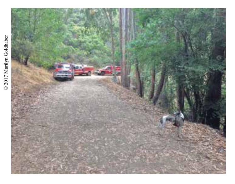
Staging of fire trucks on UC's Upper Jordan Trail during the August 2, 2017 Grizzly Peak fire set by an arsonist.

Fortunately, only around 6,000 acres of our parklands burned in the SCU Lightning Complex Fire thanks to proper trail maintenance, including fire roads, and the District's grazing program. Most of the total acres burnt were south of Sunol Wilderness and Ohlone Wilderness. To read more, go to https://www.ebparks.org/subscribe/. (Excerpted and reprinted with permission from the EBRPD.)