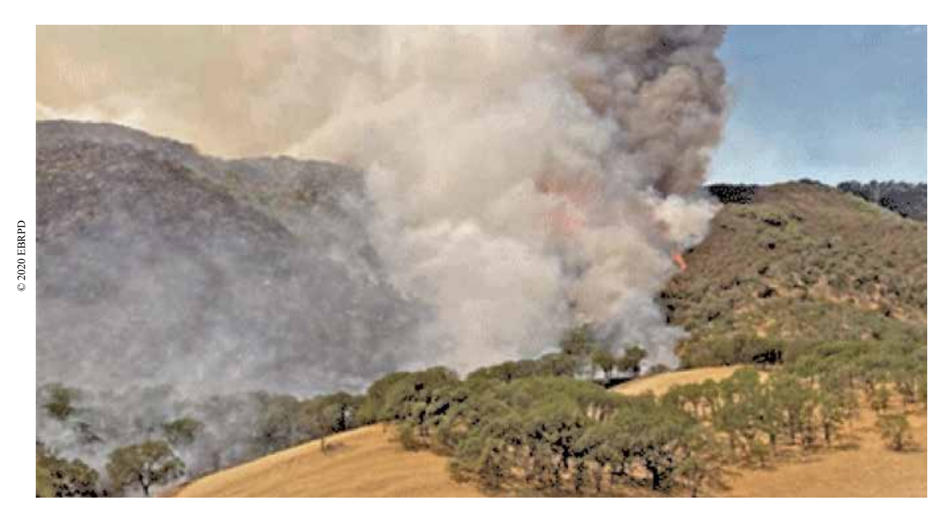
The Santa Clara Unit Lightning Complex Fire hits Park District land.