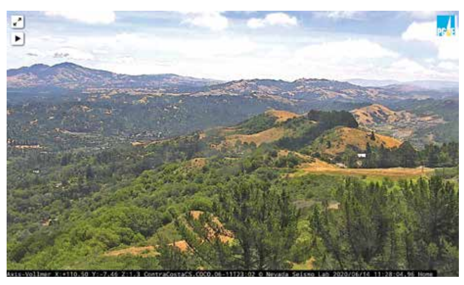
The FUEGO system uses ground-based cameras through networks such as ALERTWildfire. The map above (left) shows locations of cameras in the East Bay. The Vollmer Peak camera (yellow arrow) sees the view above when facing east.