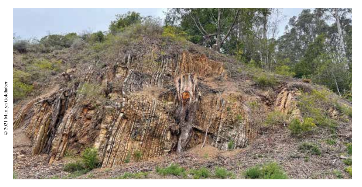
The geological outcropping across Claremont Avenue from Signpost 29 is one of the best exposures anywhere of the Claremont Chert.