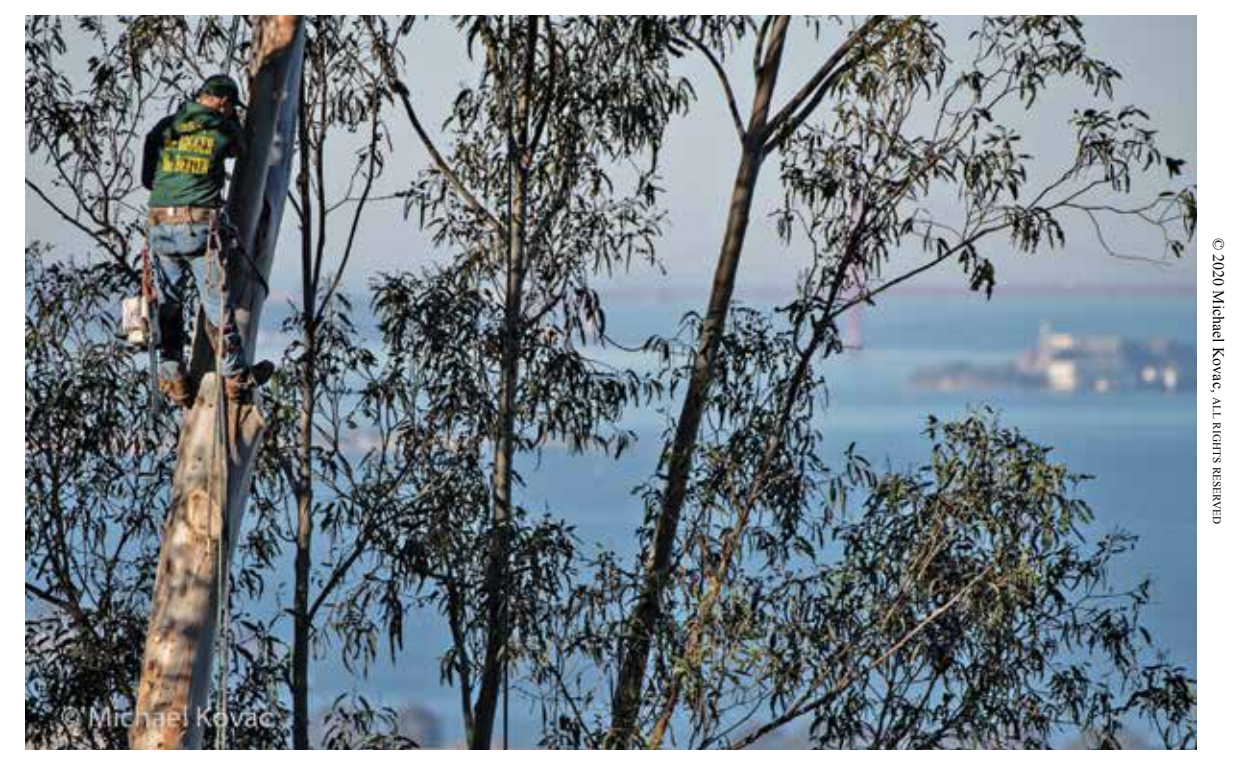
M&M tree Service takes down an oversized euc, limb by limb.