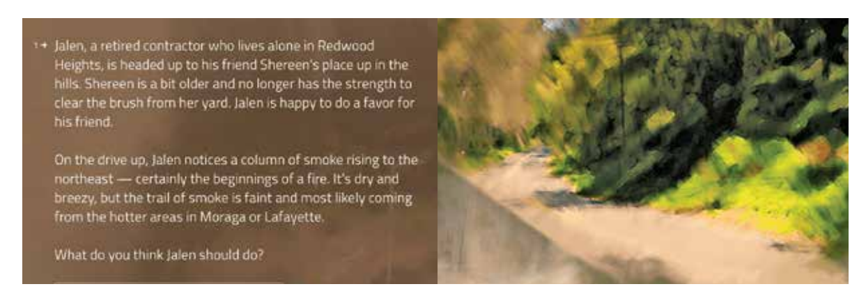
A sample question from OCP&R's evacuation training module to get participants thinking "what would I do?"