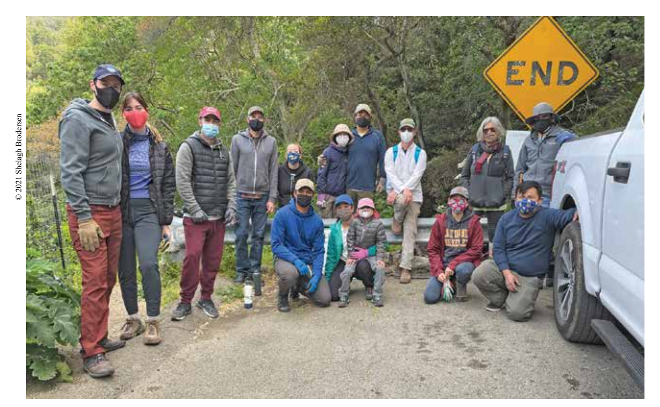
The Garber Park Stewards gather on Earth Day at the end of Evergreen Lane, which leads into Garber Park.